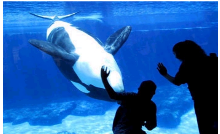
San Diego: Site of the ARS Annual Meeting, September, 2002

All members are encouraged to explore www.american-rhinologic.org . Questions and comments can be directed to arsinfo@american-rhinologic.org .