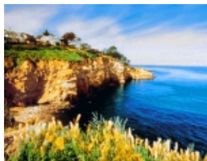
San Diego: Site of the ARS Annual Meeting, September, 2002